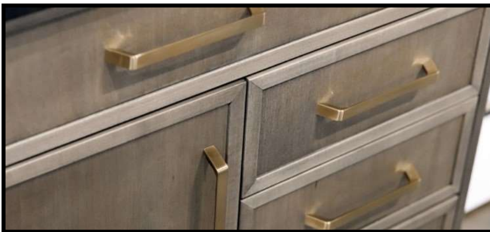
HANDLES ON RECESSED PANEL OF DOORS AND HANDLES ON DRAWERS