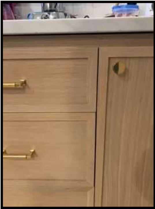
KNOBS ON RECESSED PANEL OF DOORS AND HANDLES ON DRAWERS